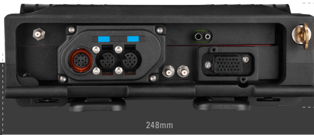
APX 8500 High-Power Model Shown

*Compatible with Sierra Wireless MG90 only