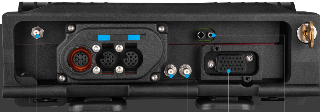
RF antenna port

When the mission takes you out of range, you risk being left in the dark. The APX 8500, equipped with SmartConnect, can reroute P25 voice and data communication over broadband via built-in Wi-Fi or a tethered LTE/satellite router. Stay connected to your P25 radio system, even when outside of P25 coverage.